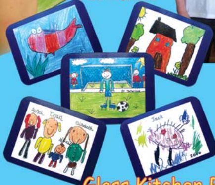
Glass Kitchen Boards